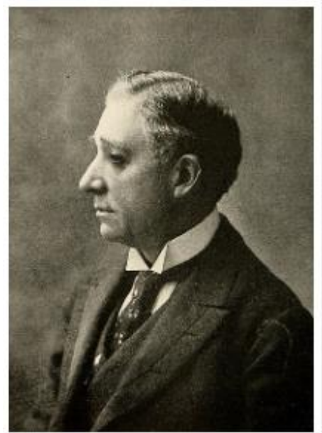
William Bourke Cockran, 1854-1923, photographed circa 1901.

There would be many other consequential first dinners, but the one with Cockran clearly must rank first. Not that they always agreed. One debate involved the assignment Churchill had