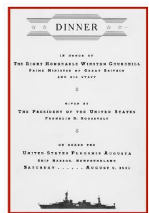
USS "Augusta" dinner menu, 9 August (From "Dinner With Churchill," by permission of the author)

Placentia Bay has to be counted with the Bourke Cockran and Clementine Hozier first dinners as extraordinarily consequential. They meant as much to Churchill personally as to the world at large. Cockran provided introductions and intellectual nourishment. Clementine provided emotional support, much love, calming advice and vital home intelligence when her husband was away. Roosevelt provided the military support that allowed Churchill to mold the "Grand Alliance" that would crush the Axis. It was to the third major partner in that alliance that he next turned his attention.