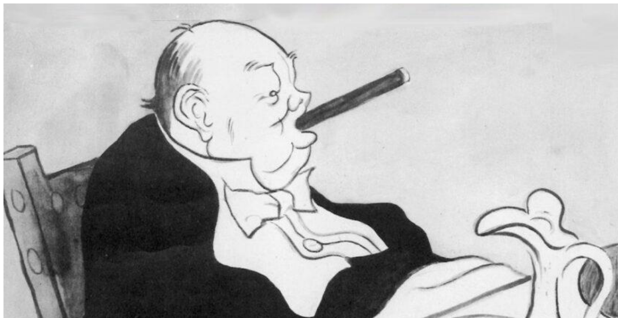
“Winston at Table,” cartoon by Vicky, 1930s.